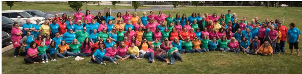
Bauer Head Start Staff

For a complete description of services and policies, please visit our website at: